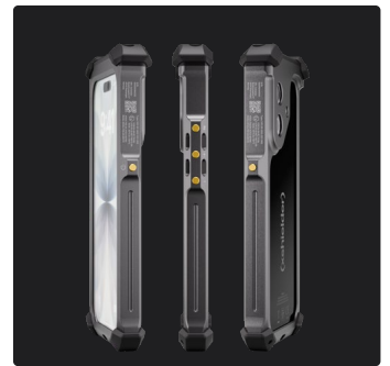
Lightest & slimmest